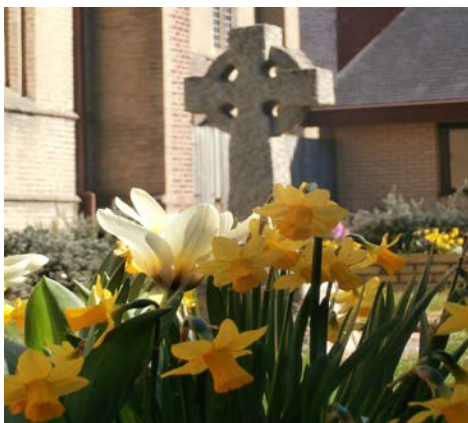
Details of Easter Services see Page 2